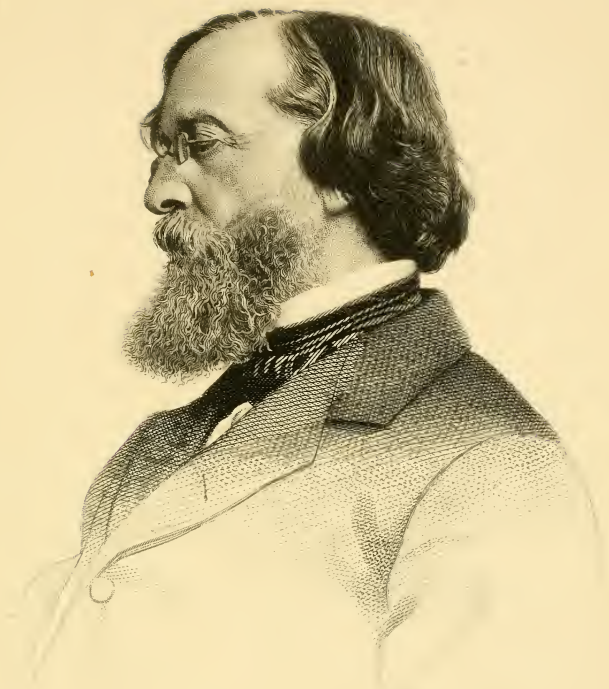
JAMES FREEMAN CLARKE.